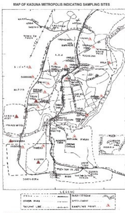
Figure-1 Map of the Sampling points and the control site