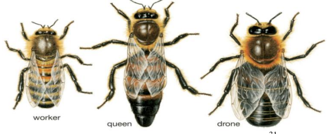
Figure-1: Three kinds of Apismellifera<sup>31</sup>.

The queen is possibly the most important caste in the bee colony because she is responsible for reproducing other castes leading to the colony's survival<sup>32</sup>. The rapid development of the queen bee and worker bees are important because; (i) when the colony loses her queen, its focus and coordination are disrupted, and thus, the colony as a whole is thrown into disarray. In order for the colony to preserve its social behavior, the lost queen must be replaced as soon as possible by a new virile queen. (ii) For the worker bees, there is a need for rapid generation turnover, and a short developmental time may be advantageous in this regard<sup>33,34</sup>.