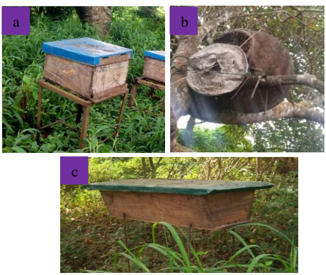
Figure-2: (a) Modern movable frame hive; (b) Clay pot hive; (c) Kenyan top bar hive.

grasses. Hives can be classified into a traditional and high technology movable frame hives<sup>7</sup>. Other necessary equipment includes protective suit with a veil, hand gloves, smoker, honey extractors, rubber containers, cutlass, knife, baiting agent, storage bottles, funnel/sieves etc.